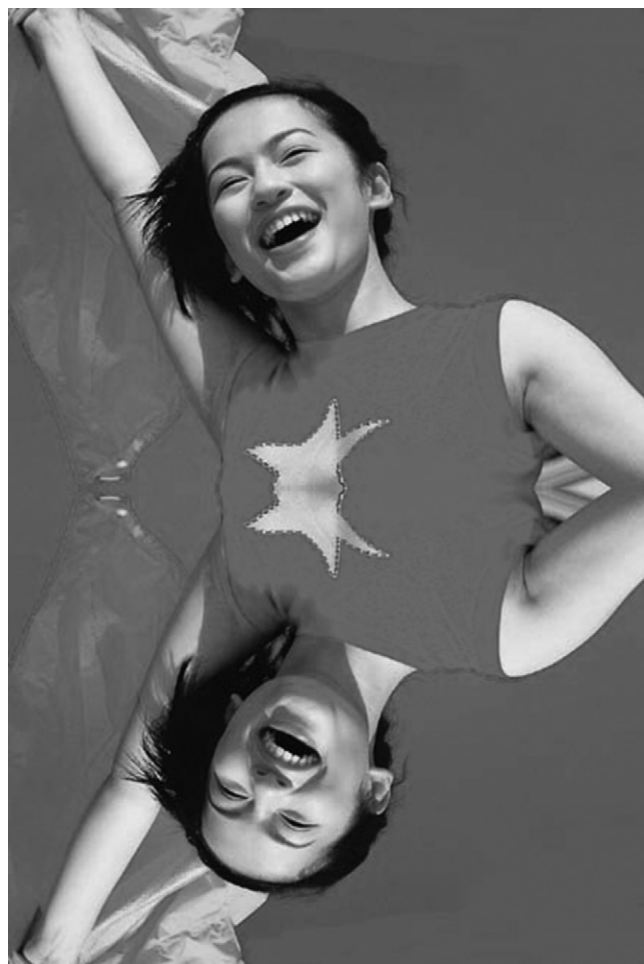
Fig. 1. An example of the target pictures. Its upright part (normal scene) is located in the upper position of the whole patchwork.

The participants were told that they would be watching pictures on a computer monitor located approximately 70 cm in front of their eyes. The stimuli presenting procedure would follow a ‘fixation-cue-target-response signal’ sequence. In the beginning of each trial, a white cross (0.7 cm × 0.7 cm) on a black background was presented at the center of the screen as